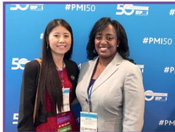
PMI Leadership Institute Meeting 2019 North America #PMILIM